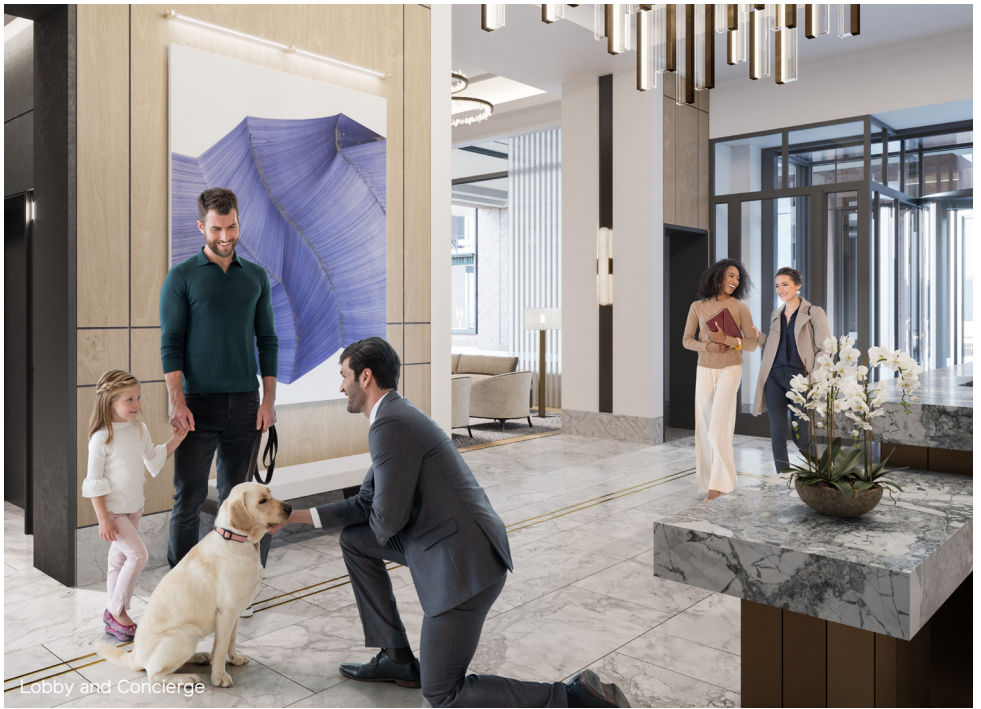
Lobby and Concierge