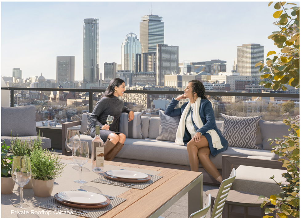
Private Rooftop Cabana